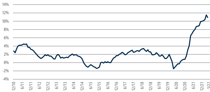
Figure 1 U.S. PPI Final Demand YoY NSA