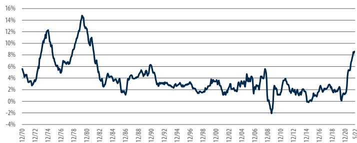
Figure 2 U.S. CPI Urban Consumers YoY NSA