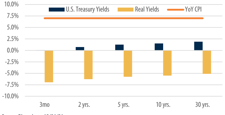
Figure 10 U.S. Treasury Yield Curve and CPI