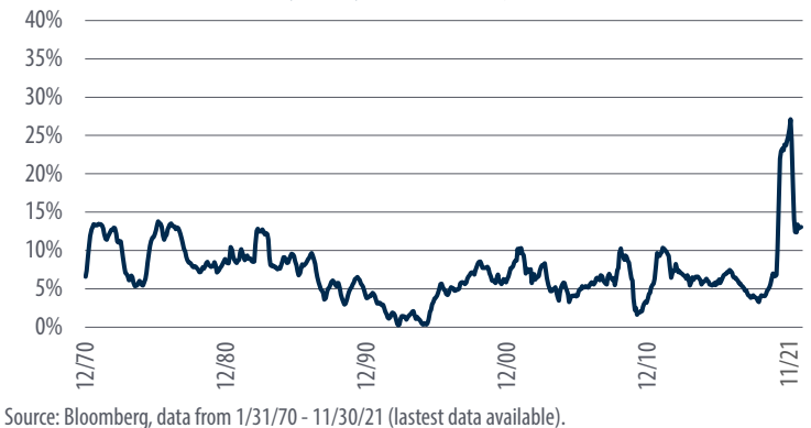
Figure 4 Federal Reserve Money Supply M2 YoY% Change