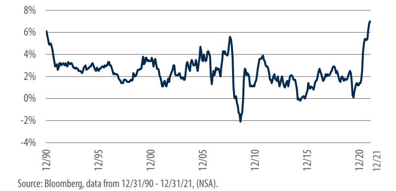
Figure 1 U.S. PPI Final Demand YoY NSA

References to specific companies or securities should not be construed as a recommendation to buy or sell any such security, nor should they be assumed profitable.