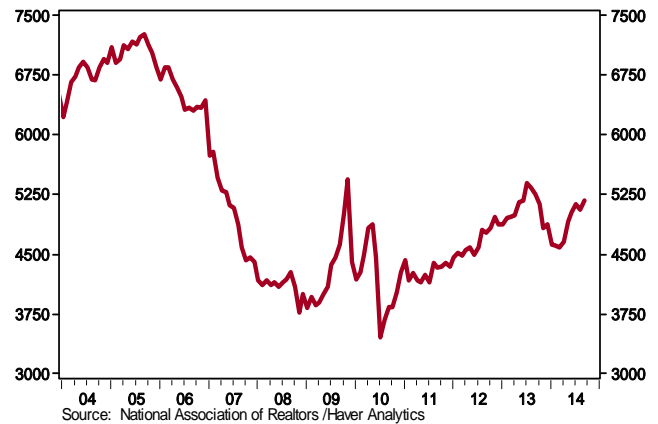
Existing Homes: Median Sales Price

Existing Homes: Median Sales Price 12-month Moving Average