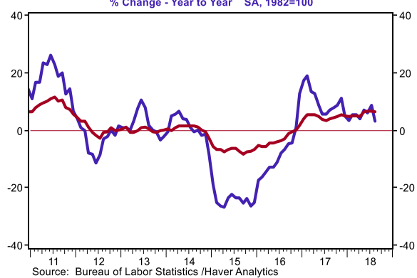
PPI: Intermediate Demand Unprocessed Goods % Change - Year to Year SA, 1982=100

the result of companies accepting smaller margins in the short-term, rather than raise prices for consumers, as input prices increase. A look at recent ISM reports suggests strong order activity paired with difficulty finding qualified labor and freight truck drivers is putting price pressure on some industries. Excluding declines in food, energy, and trade services, producer prices rose 0.1% in August and are up 2.9% in the past year, tied for the highest twelve-month increase since the series began in late 2014. We expect the soft patch in July and August won't sustain, and monthly data will once again show rising prices in the months ahead. With economic growth above 3%, a tight labor market, and trend inflation above two percent, we believe more rate hikes are inevitable.