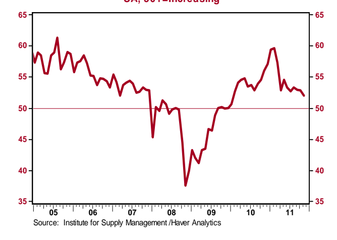
ISM: Nonmfg: Prices Index SA, 50+ = Econ Expand