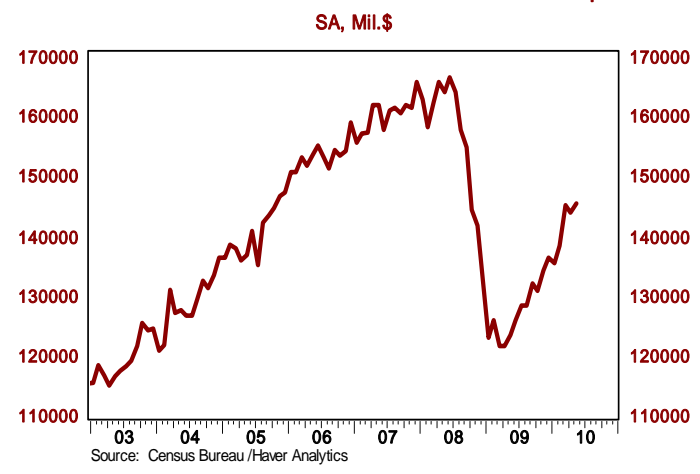
Mfrs' Shipments: Nondefense Capital Goods ex Aircraft

Implications: Today's economic reports should help reverse the recent consensus that the US economy is stumbling. Excluding the transportation sector, which is extremely volatile from month to month, new orders for durable goods were up 0.9% in May and up 1.3% including upward revisions for April. Including transportation, overall orders were down 1.1% in May, but that follows a sharp 3% gain in April. Meanwhile, shipments of "core" capital goods, which excludes defense and aircraft, increased 1.6% in May and are up at a 16.5% annual rate in the past three months, near the strongest gains of the past 20 years. This is the data the government uses to estimate business investment in equipment. Gains in these shipments should continue; for the third straight month, new orders for core capital goods were running above shipments. In other news this morning, new claims for unemployment insurance fell 19,000 last week to 457,000. Continuing claims for regular state benefits declined 45,000 to 4.55 million.