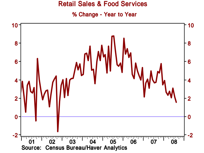
Retail Sales and Food Services EX: Autos and Building Materials % Change - Year to Year

Implications : Fears the consumer has pulled the US into recession ratcheted up today as retail sales unexpectedly declined in August (the 2<sup>nd</sup> consecutive drop) and June/July sales were also downwardly revised. But these fears are Monthly declines in retail sales happen regularly, even in non-recession years. There have been 16 monthly declines reported since the beginning of 2004, with sales falling during four different months of 2006 (two of them consecutively), and three months in 2007. extraordinary rise in gasoline prices (nearly 15 cents a month for 9 months in a row), is explanation enough. Consumers were shell-shocked. Even rebate checks did not The pace of sales growth was faster in the four months before the rebates than the four months after. With gasoline prices now heading lower, and pent-up consumer demand building, retail sales have probably seen their worst. Although the sales that matter for GDP, "core" retail