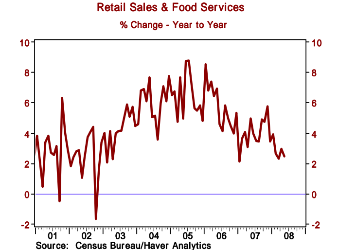
Retail Sales and Food Services EX: Autos and Building Materials % Change - Year to Year

Implications : Today's report is the final nail in the coffin for the theory that the US is in a consumer-led recession. Total retail sales are up at an 8% annual rate in the past three months while "core" retail sales are up at a 10.2% rate. impossible to be in a consumer-led recession when retail sales are growing so rapidly. Some analysts will attribute the strength in sales to the tax rebate checks that started being sent at the very end of April. However, sales were revised up substantially for March and April and core sales (excluding autos, building materials, and gas) in March and April were about as strong as in May, suggesting the rise in consumption is based on fundamentals, not government checks. Today's report creates considerable upside risk to our forecast of a 1.5% real GDP growth rate for the second quarter of 2008. Meanwhile, inflation keeps getting worse. Import prices were up 2.3% in May and are up 17.8% versus last year, the highest on record (going back to 1982). This is not all due to oil. Import prices excluding petroleum are up 6.6% versus last year, the most in 20 years; export prices are up 8% versus last year, also the most in 20 years; export prices excluding